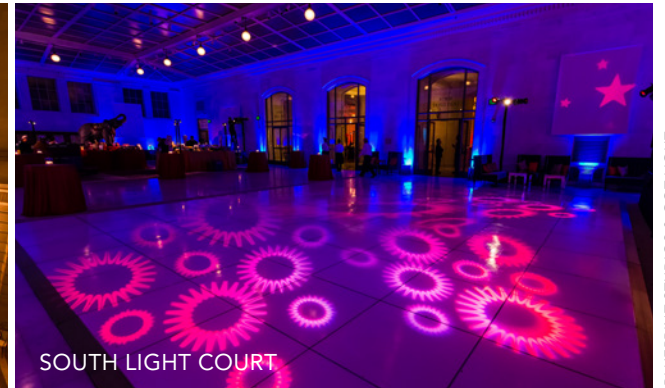
SOUTH LIGHT COURT