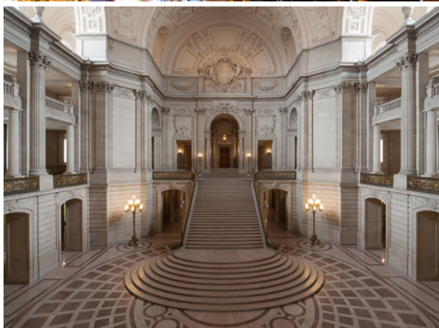
JOEL PULIATTI: ARCHITECTURAL PHOTOGRAPHER