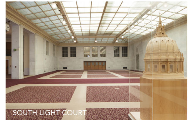
SOUTH LIGHT COURT