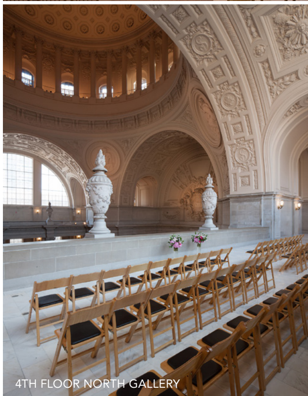
4TH FLOOR NORTH GALLERY