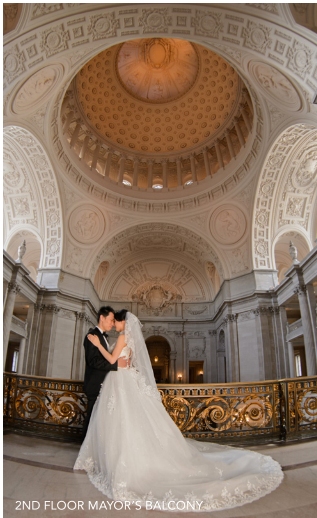
2ND FLOOR MAYOR'S BALCONY