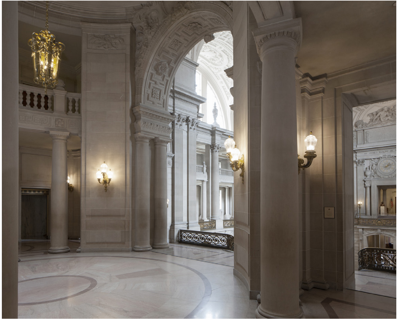
JOEL PULIATTI: ARCHITECTURAL PHOTOGRAPHER