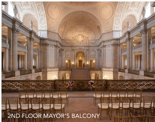
2ND FLOOR MAYOR'S BALCONY