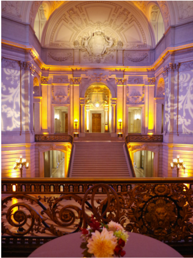
BLUEPRINT STUDIOS & GOT LIGHT