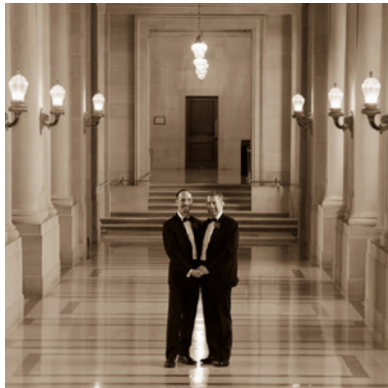
DUBNOFF WEDDING PHOTOGRAPHY