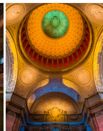
JOEL PULIATTI: ARCHITECTURAL PHOTOGRAPHER