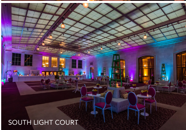
SOUTH LIGHT COURT