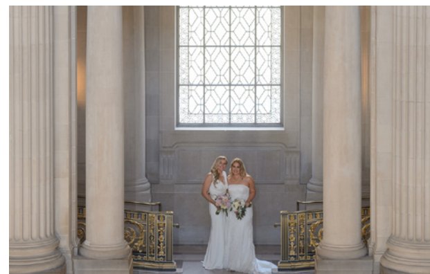
DUBNOFF WEDDING PHOTOGRAPHY

Please visit our website for a complete list of vendors and contact them directly to learn more about their services and pricing.